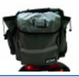
Scooter accessory package