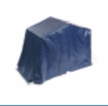
Scooter garage, folding