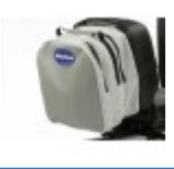
Scooter bag for the backrest