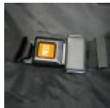
Lap belt XL