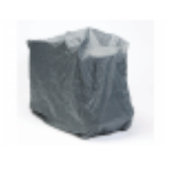
Scooter garage L