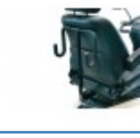
Walking aid/rollator holder