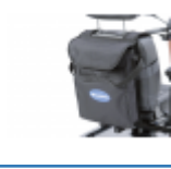
Scooter saddle bag